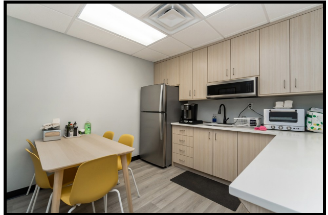
Break room: above