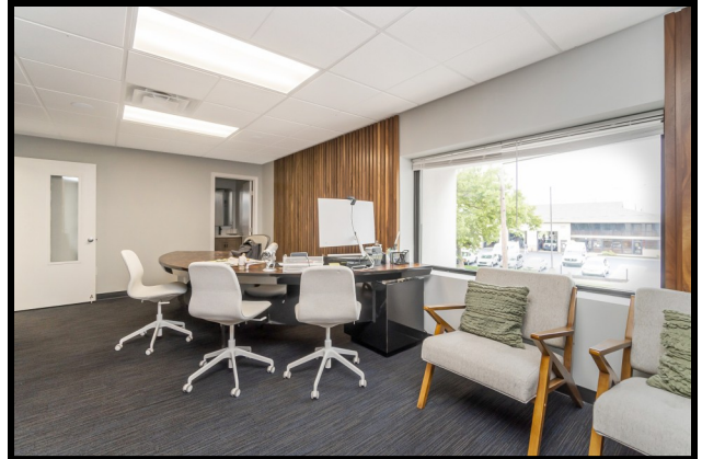
Above: CEO Office suite: With en suite bathroom