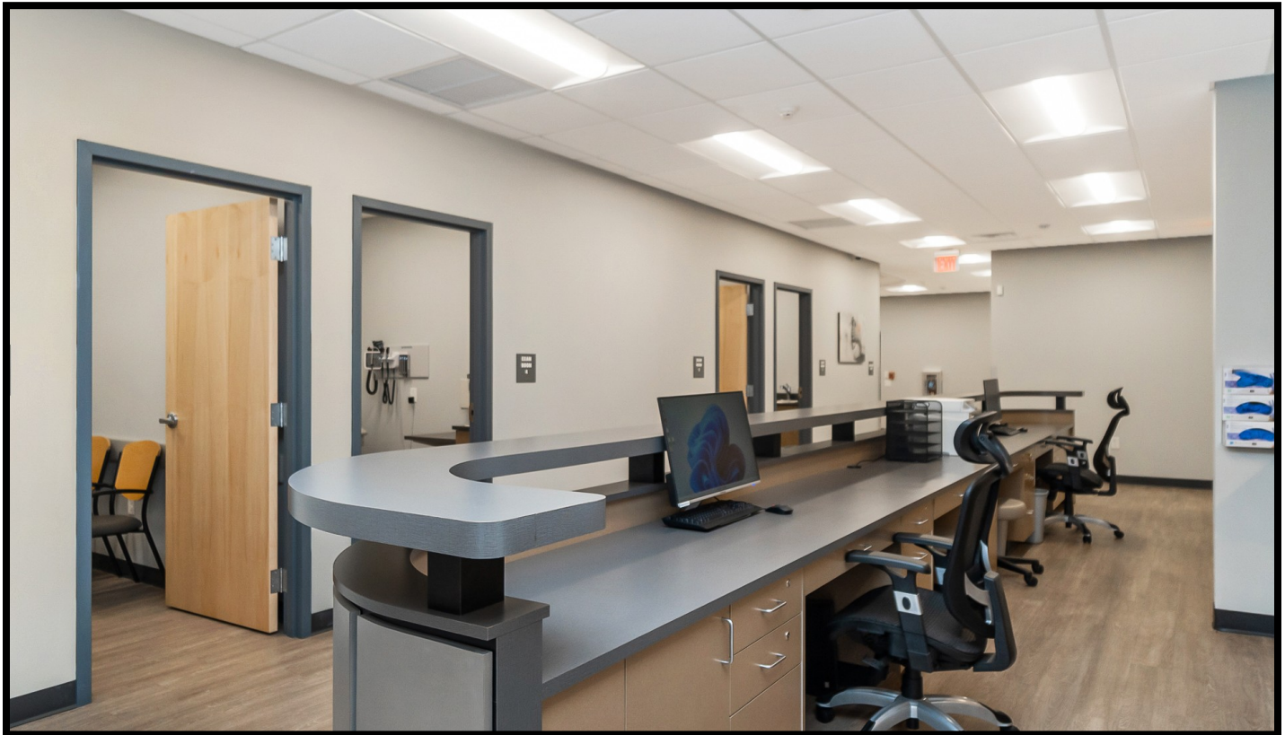
Nurses station with work area, Exam rooms, Procedure room, X-Ray room.

MEDICAL / DENTAL: 6 Exam rooms, 5 Bathrooms, 2 Triage rooms w/bathrooms, Procedure room, Storage.