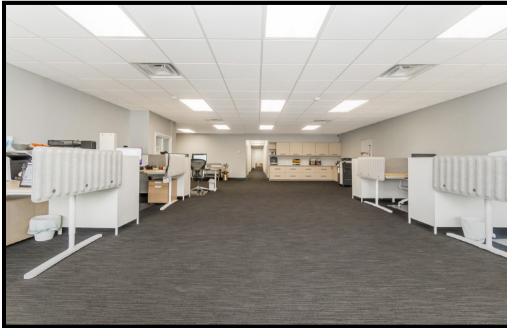
Reception and cubical space: above