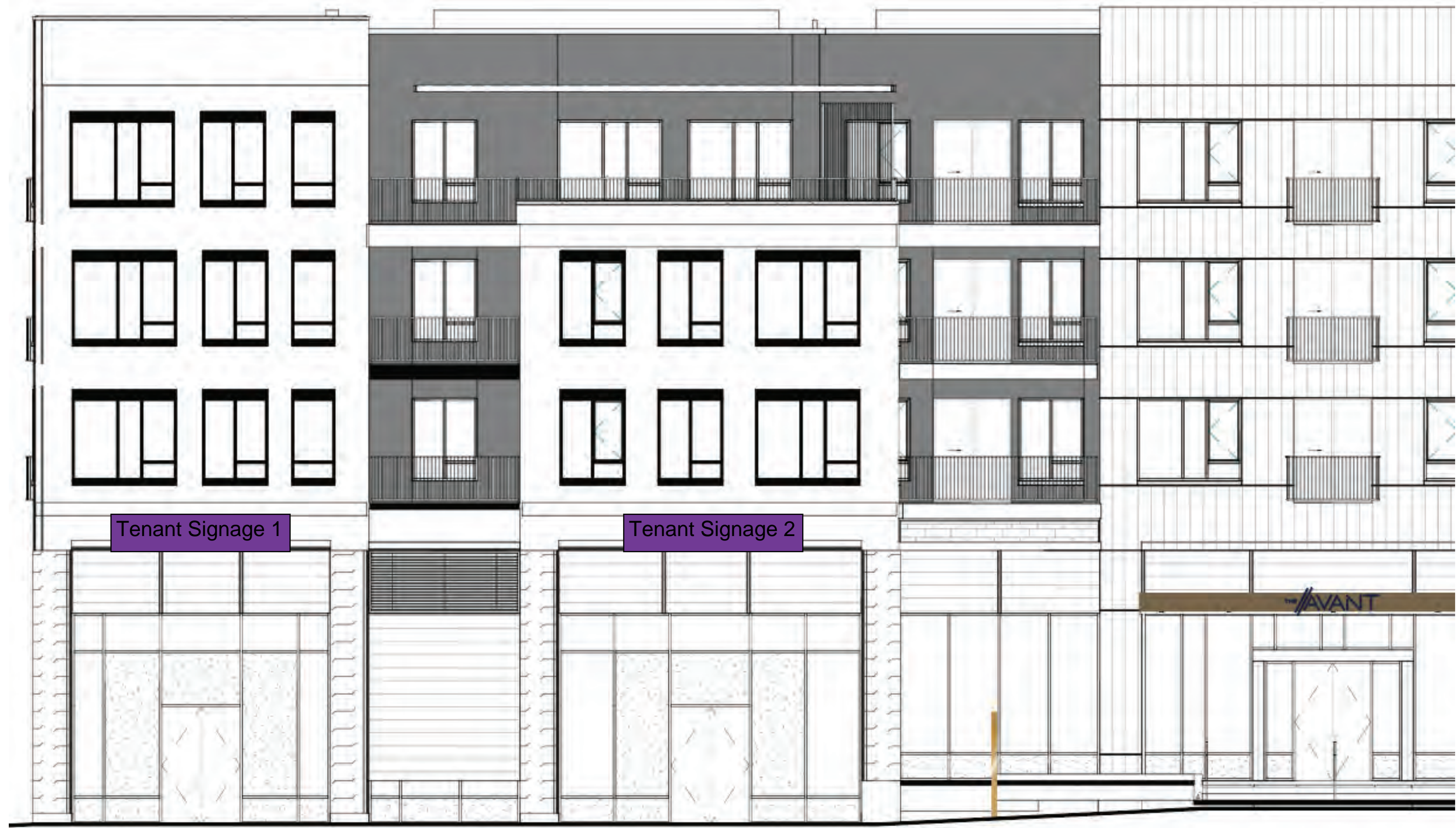
EAST ELEVATION | DIRECTIONAL SIGN LOCATION