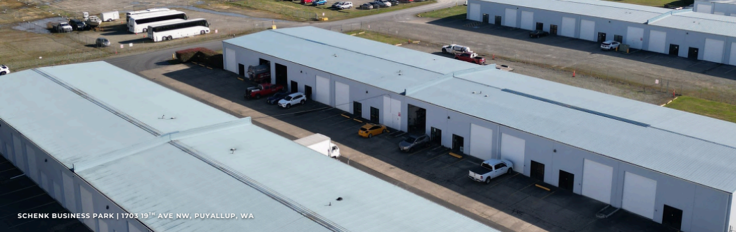
SCHENK BUSINESS PARK | 1703 19 TH AVE NW, PUYALLUP, WA