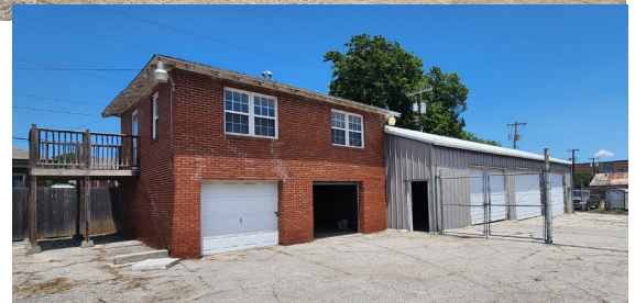
Loft/Garage and Warehouse