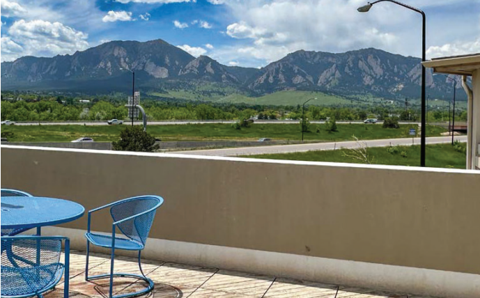
All Tenant Access Patio