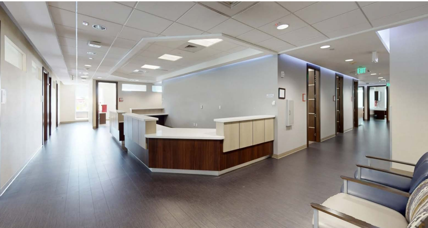
Suite 201 - 6,775 SF

Fixed reflective impact resistant glass windows set in aluminum frames