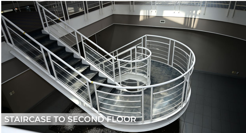
STAIRCASE TO SECOND FLOOR