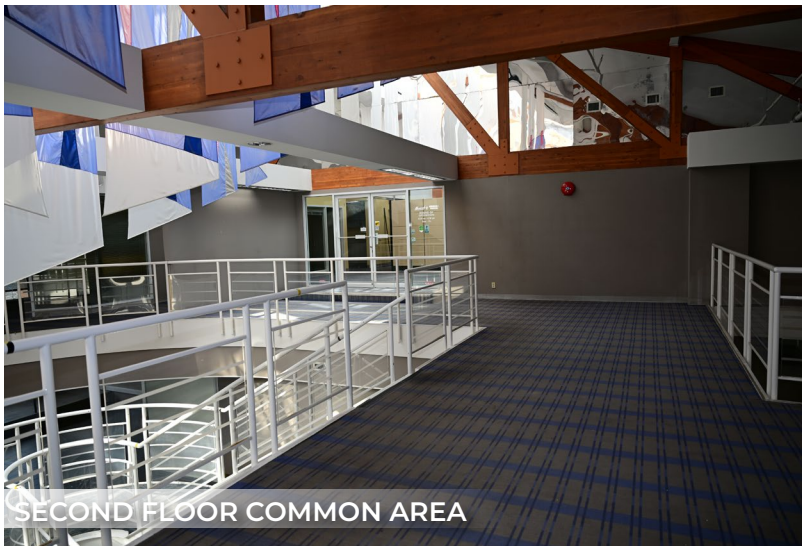
SECOND FLOOR COMMON AREA