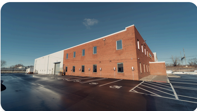
Recently renovated building exterior