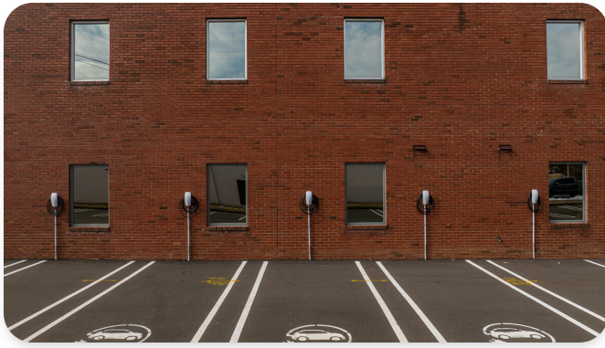
10 Tesla-compatible EV chargers