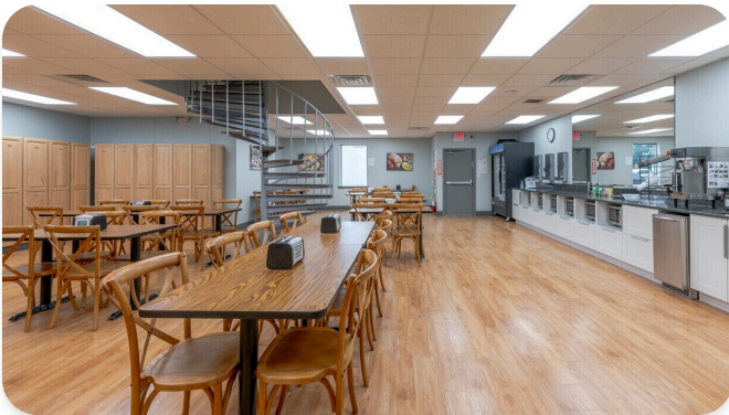
On-site cafeteria & tenant lounge