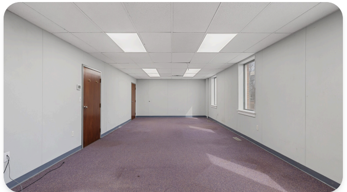
Move-in ready office space