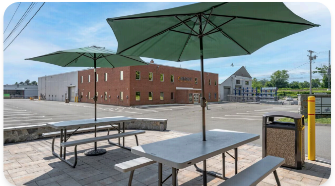
Outdoor picnic & break area