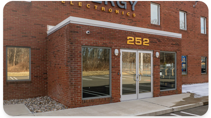
Professional main entrance