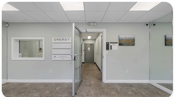
Secure lobby & reception