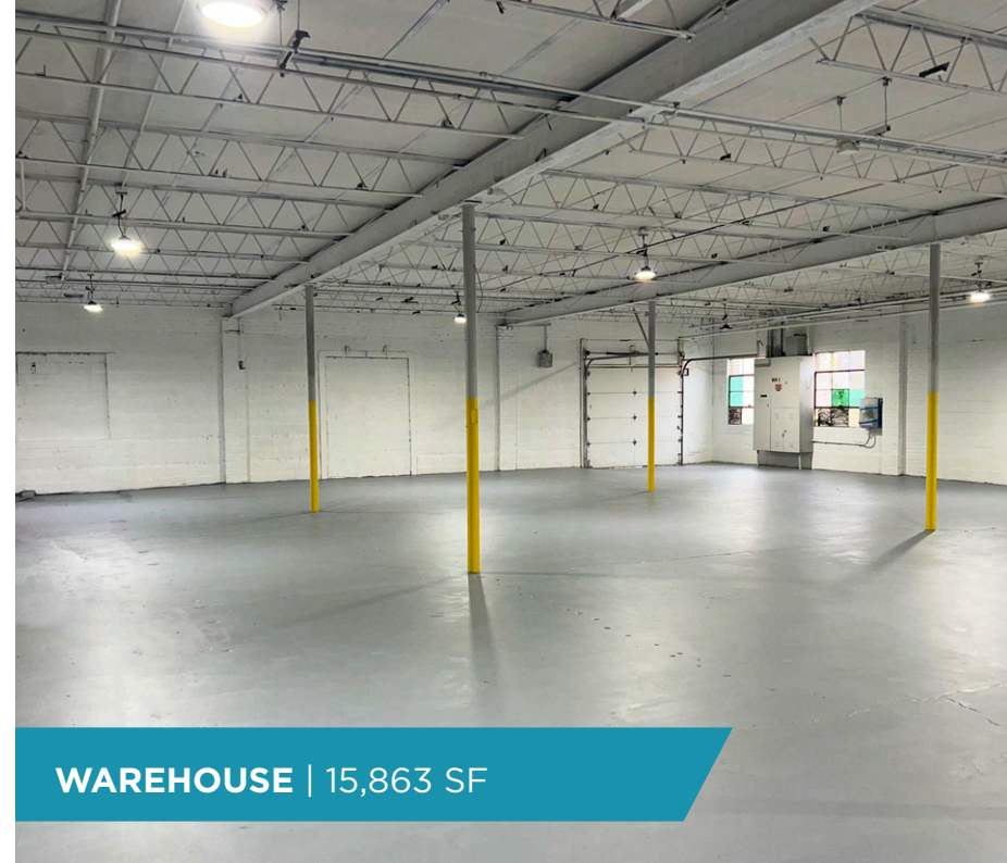
WAREHOUSE | 15,863 SF