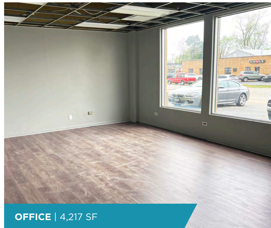
OFFICE | 4,217 SF