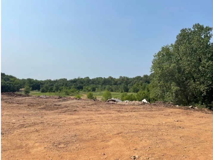
2600 E Benton - Springfield, Mo.