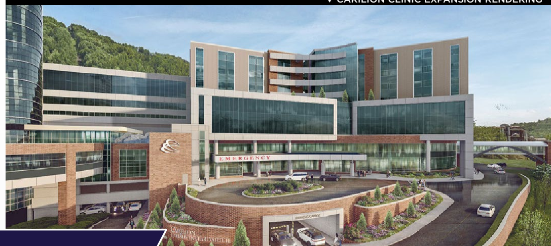
▼ CARILION CLINIC EXPANSION RENDERING