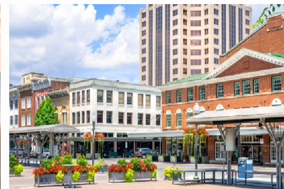
▲ DOWNTOWN MARKET CENTER