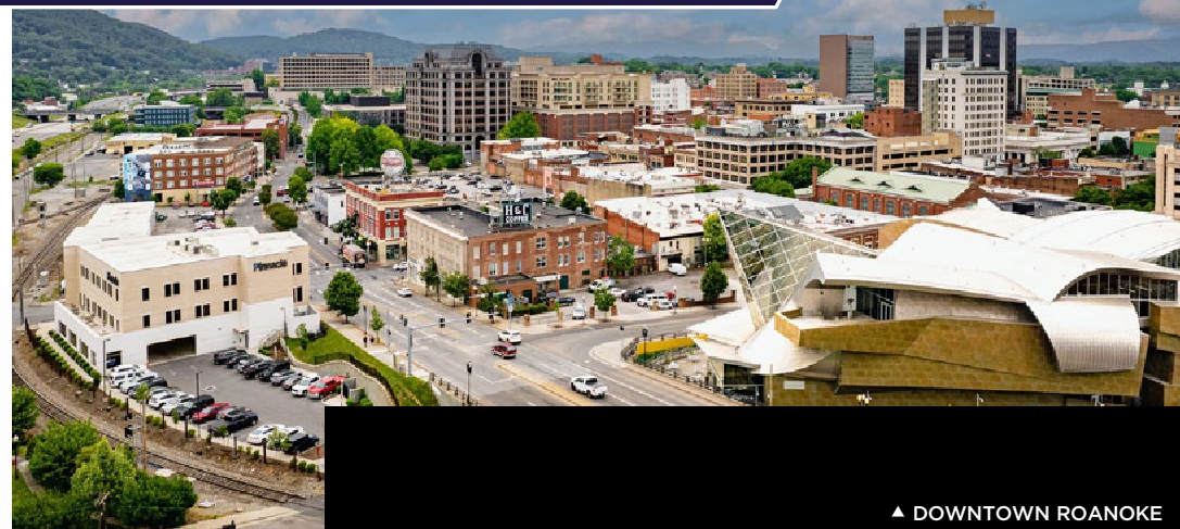
▲ DOWNTOWN ROANOKE

Named one of USA Today's "5 Best Cities to Move to in the South," Roanoke blends innovation, culture, and natural beauty with a low cost of living and high quality of life. With strong infrastructure and a thriving economy, Roanoke presents prime opportunities for residential, commercial, and industrial investment.