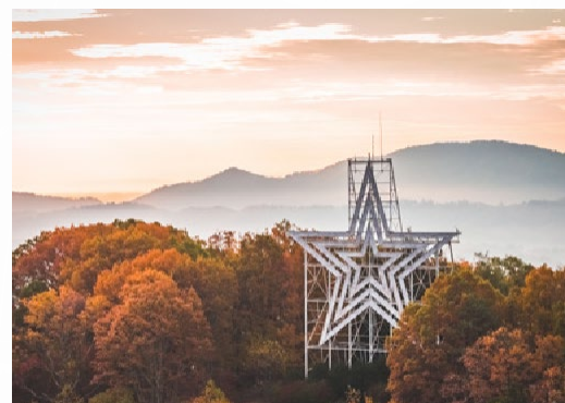
▲ ROANOKE STAR