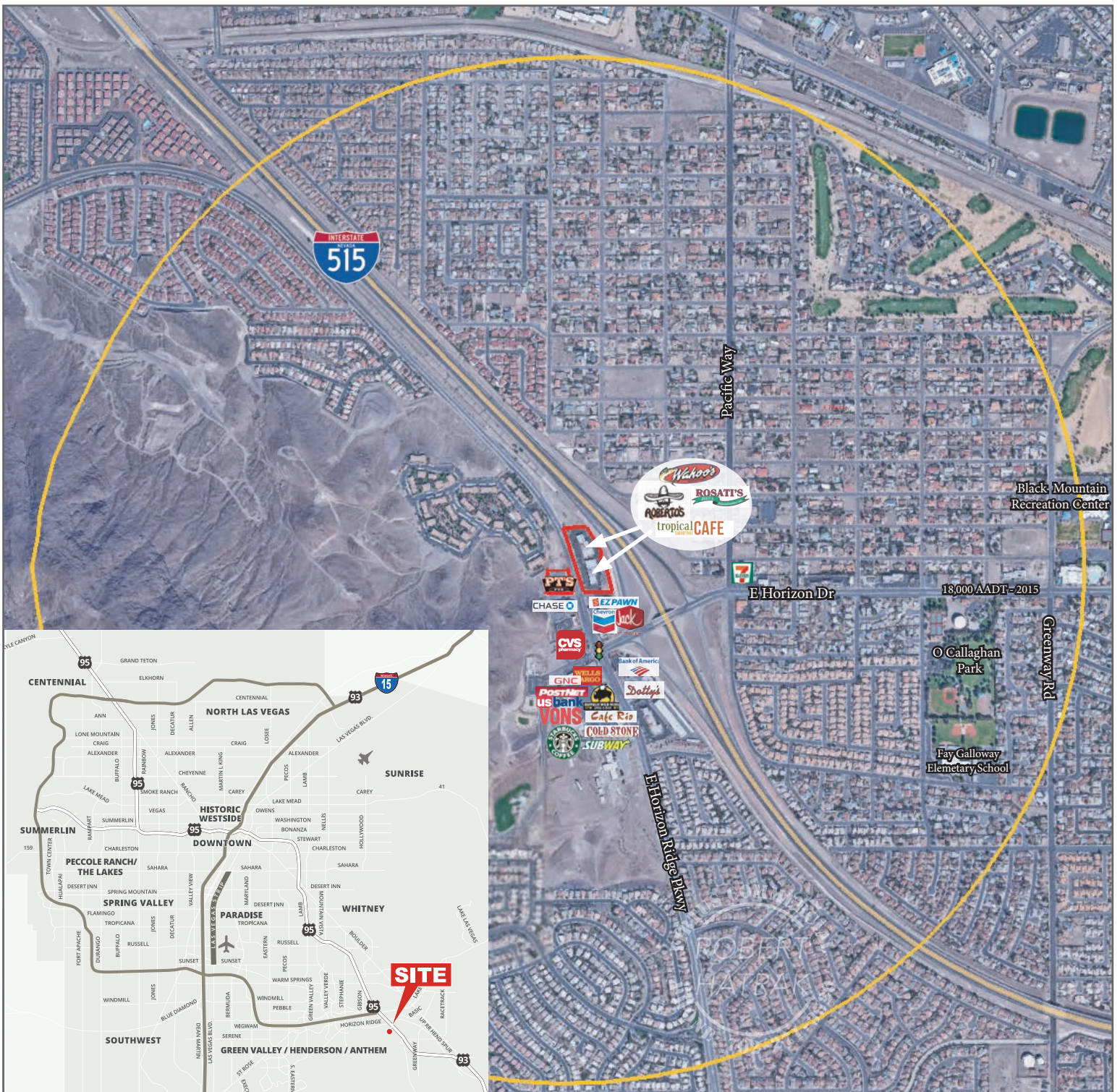
These maps are intended for general information purposes only. It is not to exact scale, and exact boundaries of areas may differ.

NEIGHBORHOOD RETAIL CENTER • 72 & 76 W Horizon Ridge Pkwy | Henderson, NV 89012