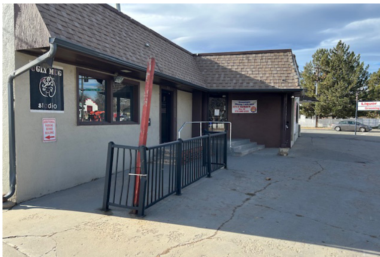
1108 E 1st Street

1106 & 1108. Two retail spaces available at the corner of 1st Street and St. Louis Ave. Leases are NNN at $15.00 and $20.00 per square foot. 1104 E 1st St. 1450SF at $15.00 per foot = $1,812.5 per month. 1108 E 1st St. 436 SF at $20.00 per foot = $727.00 per month. Off street parking on site, individually metered for gas and electric, water and sewer included in rent.