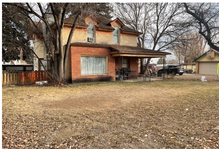
1106 E 1st Street