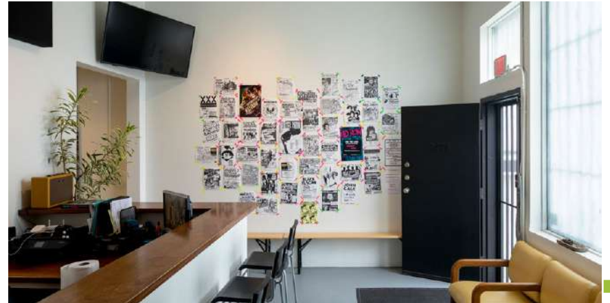
A— ENTRANCE / RECEPTION