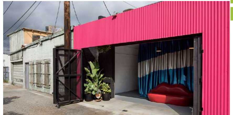
C— BACK ENTRANCE