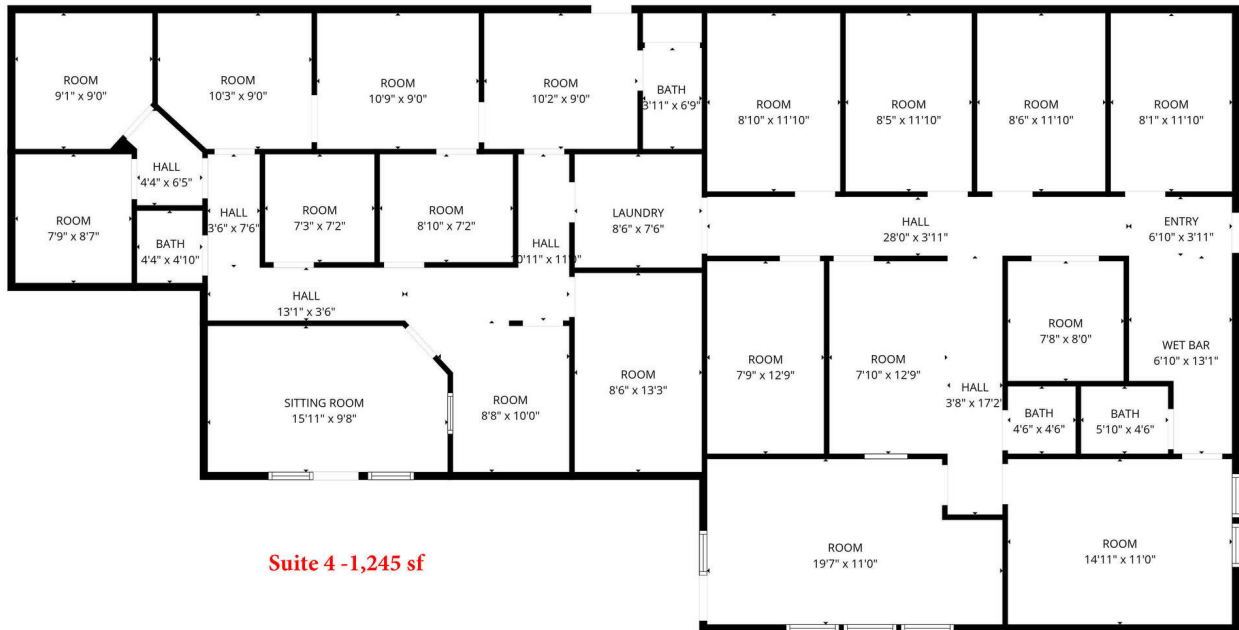
Suite 4 -1,245 sf