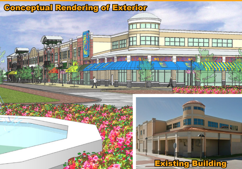
Conceptual Rendering of Exterior