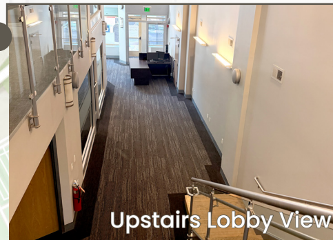
Upstairs Lobby View