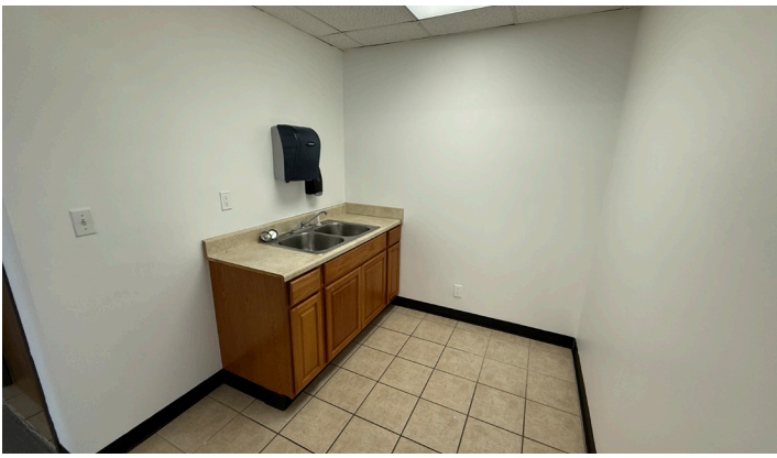
WET BAR/BREAK AREA