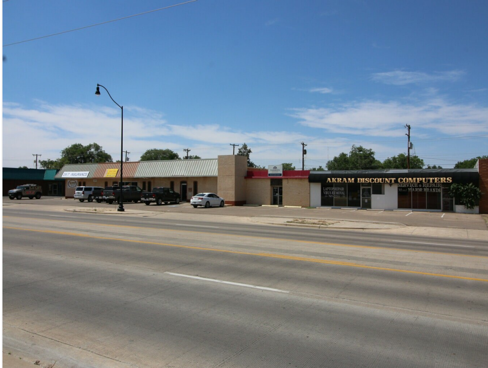
3206 - 3212 34th Street