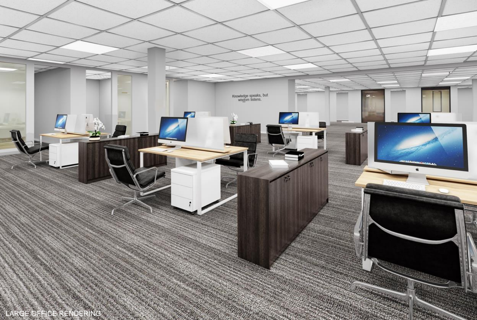
LARGE OFFICE RENDERING