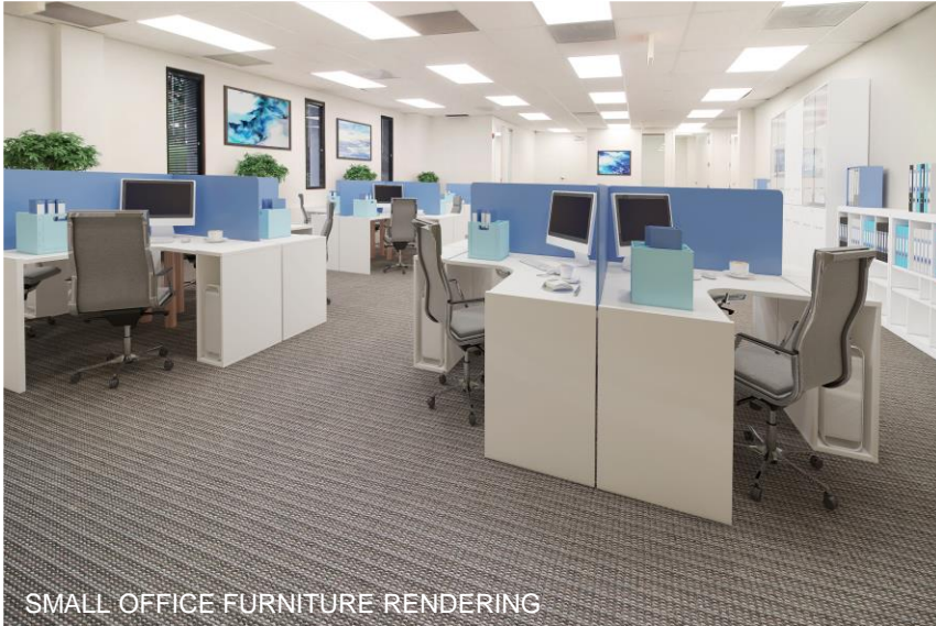
SMALL OFFICE FURNITURE RENDERING