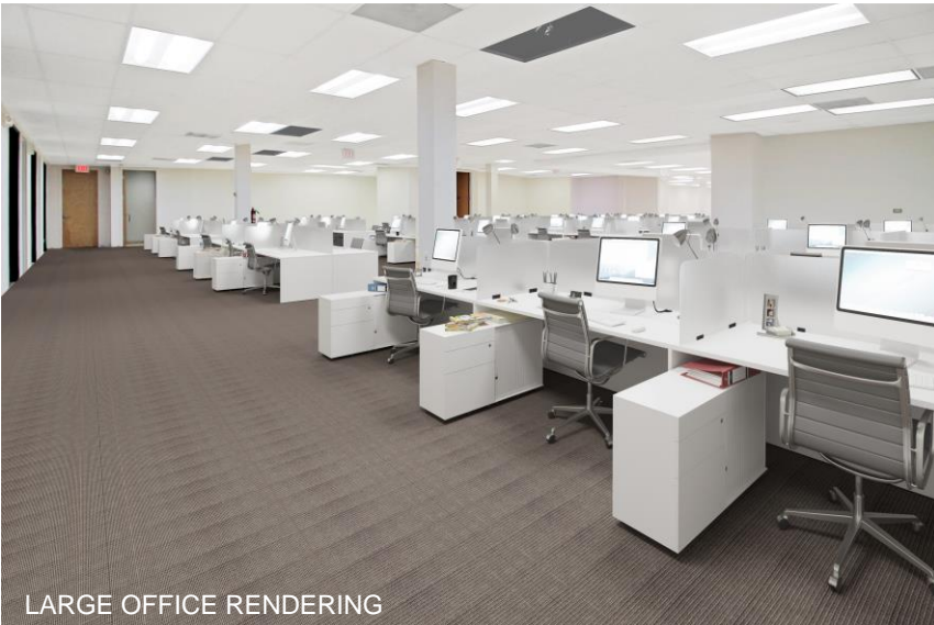
LARGE OFFICE RENDERING