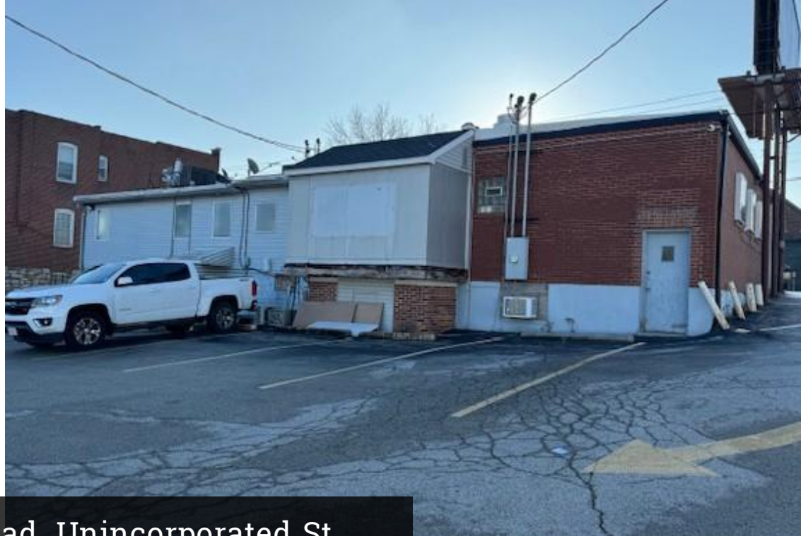
8713 Gravois Road, Unincorporated St. Louis County, Missouri 63123