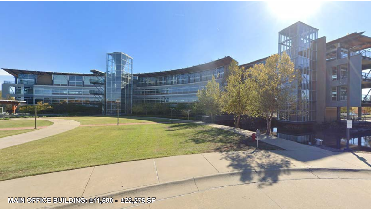
MAIN OFFICE BUILDING: ±11,500 - ±22,275 SF