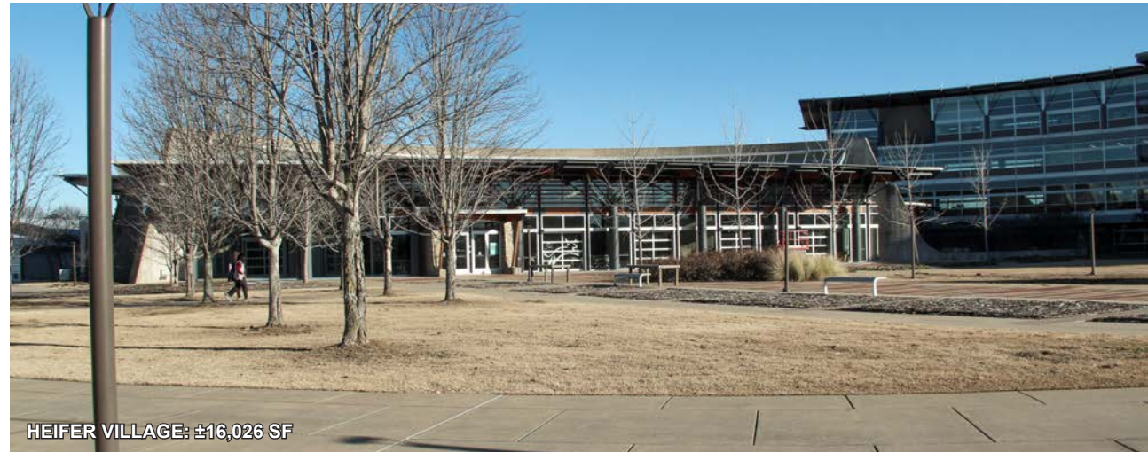
HEIFER VILLAGE: ±16,026 SF