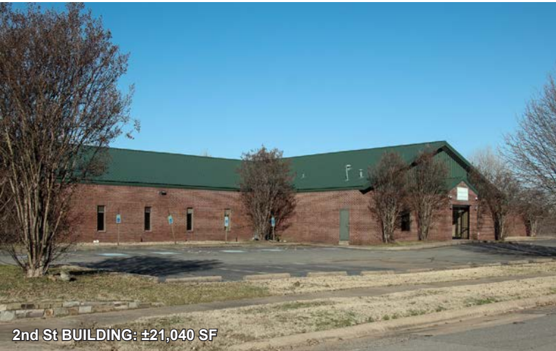
2nd St BUILDING: ±21,040 SF