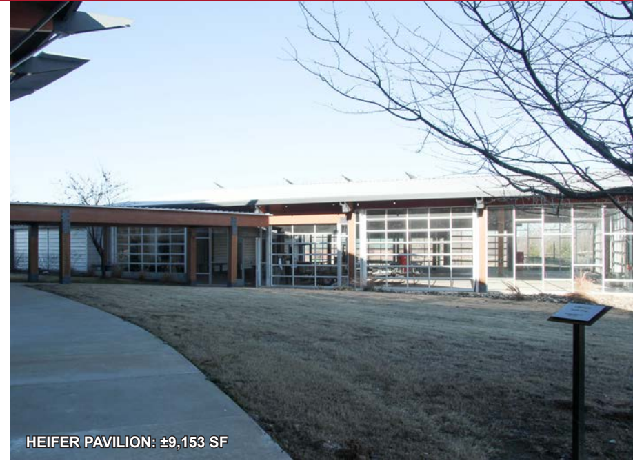
HEIFER PAVILION: ±9,153 SF