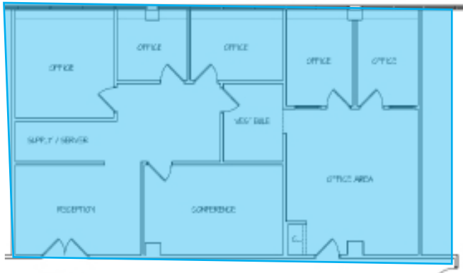
12th floor space 2,116 SF