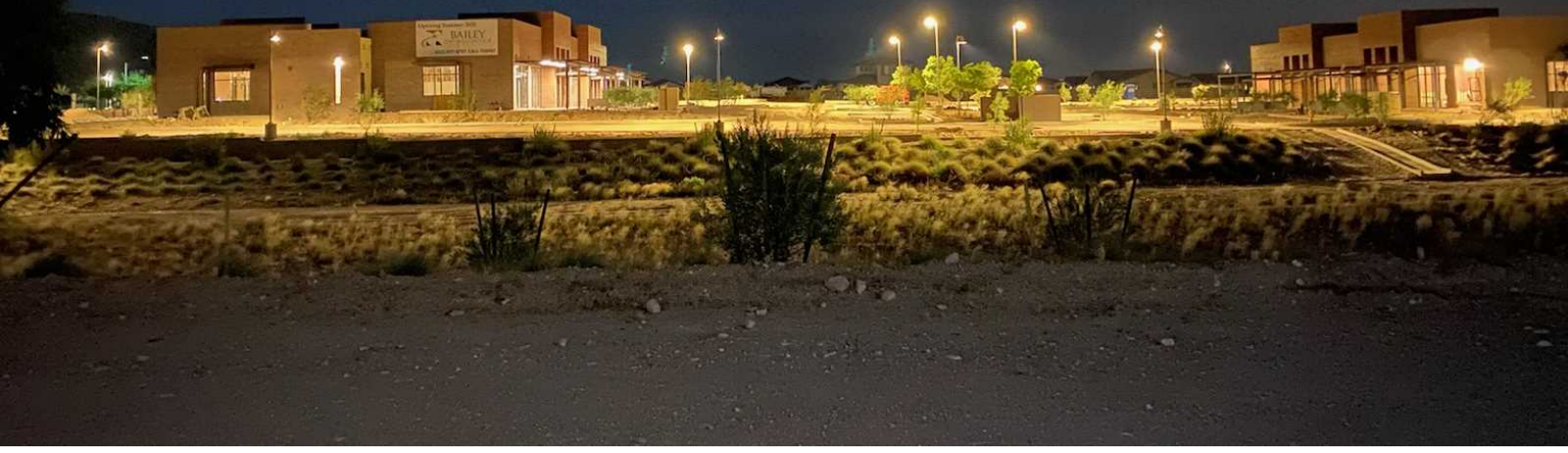
4161 N. Pioneer Drive