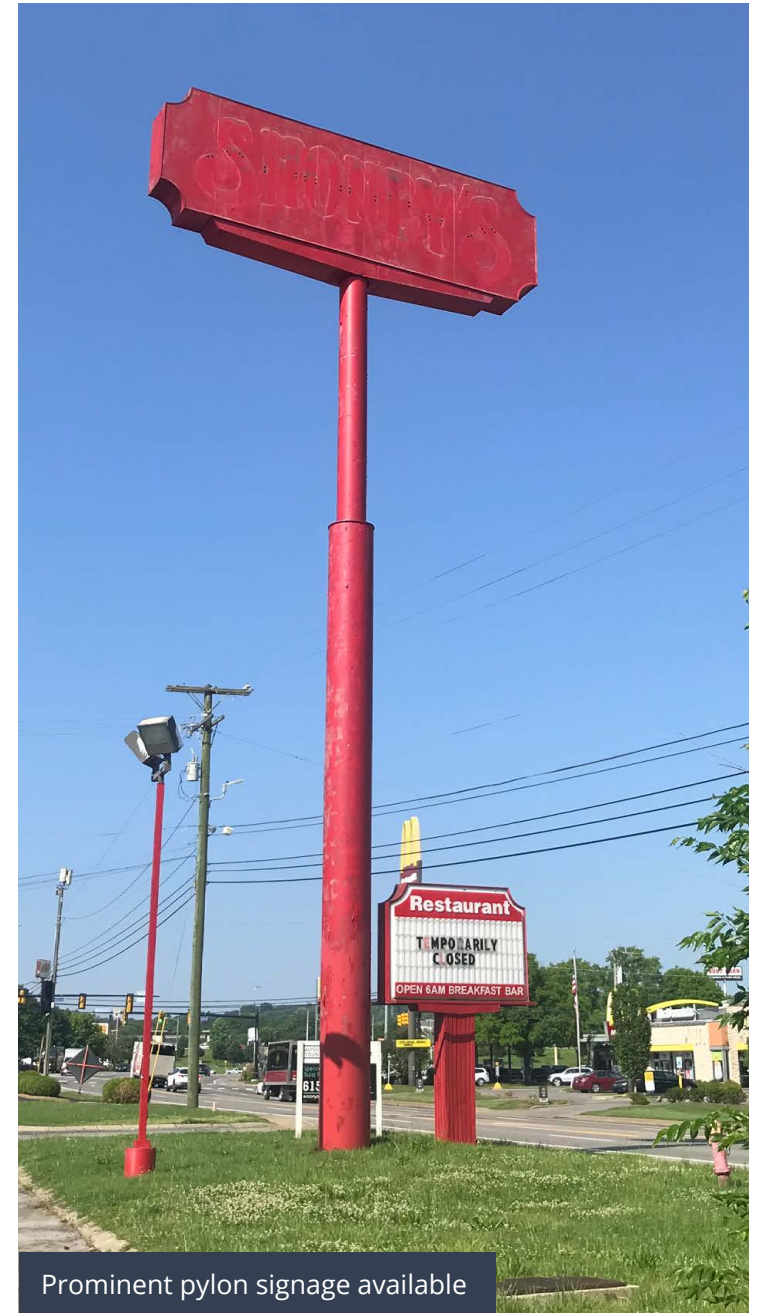
Prominent pylon signage available