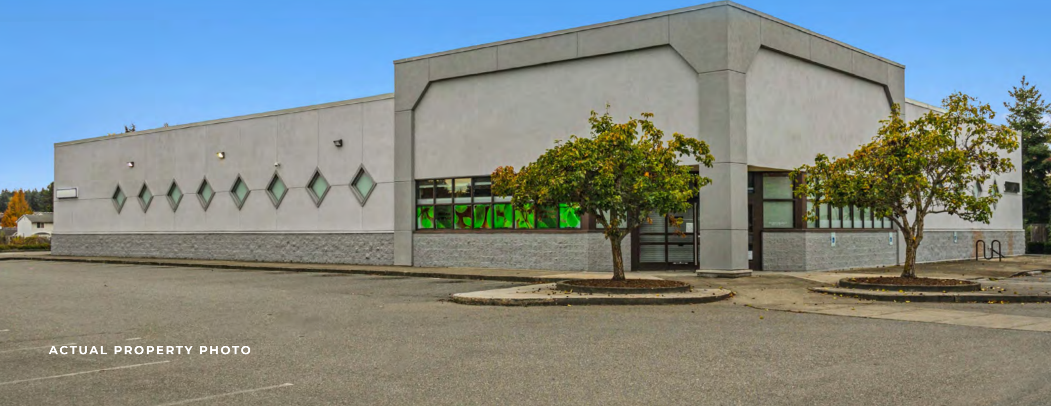
ACTUAL PROPERTY PHOTO