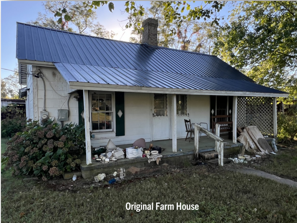
Original Farm House