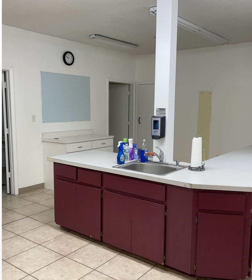
Central work area