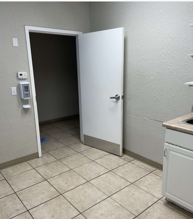
Typical exam room/office