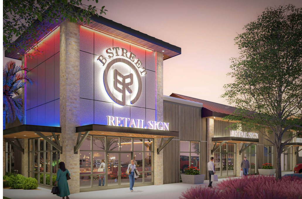
*PROPOSED RENDERINGS, SUBJECT TO CHANGE

We invite you to join us in creating a vibrant atmosphere filled with art, cuisine, music, shopping, fitness and more.