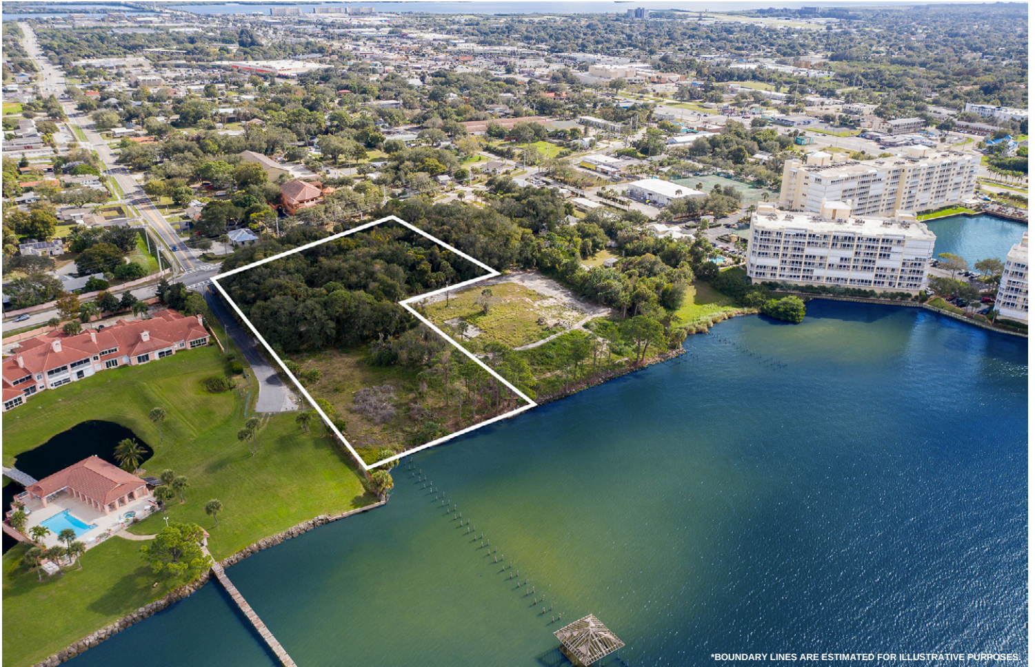
*BOUNDARY LINES ARE ESTIMATED FOR ILLUSTRATIVE PURPOSES.