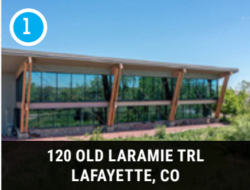
120 OLD LARAMIE TRL LAFAYETTE, CO