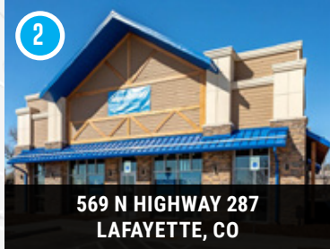
569 N HIGHWAY 287 LAFAYETTE, CO