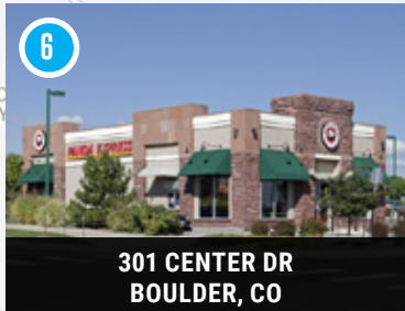
301 CENTER DR BOULDER, CO