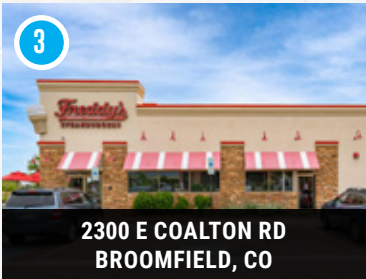
2300 E COALTON RD BROOMFIELD, CO