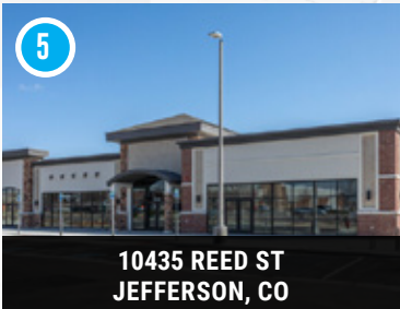
10435 REED ST JEFFERSON, CO