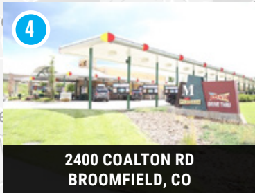
2400 COALTON RD BROOMFIELD, CO