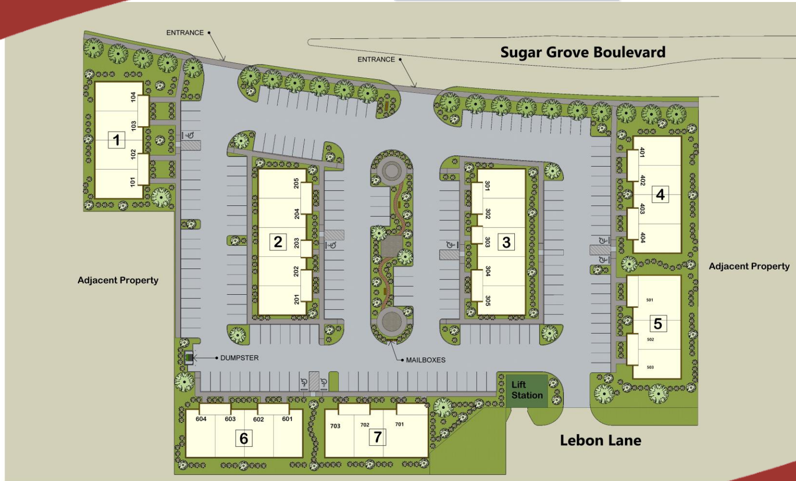
Sugar Grove Office Condominiums