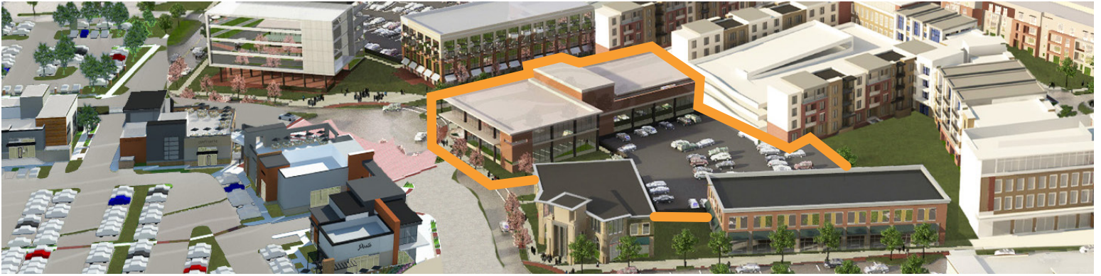
View looking south