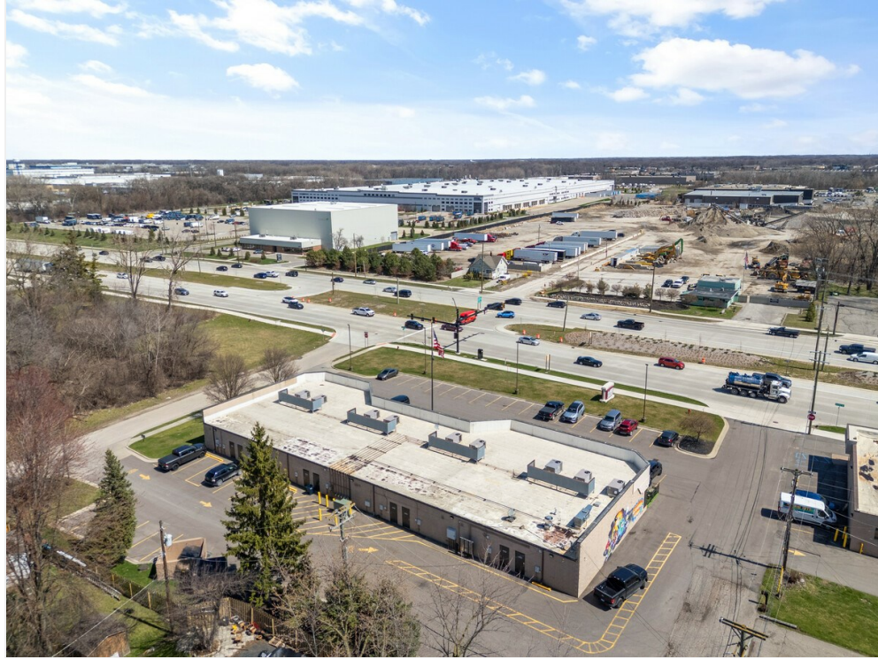
33241 Mound Rd_064