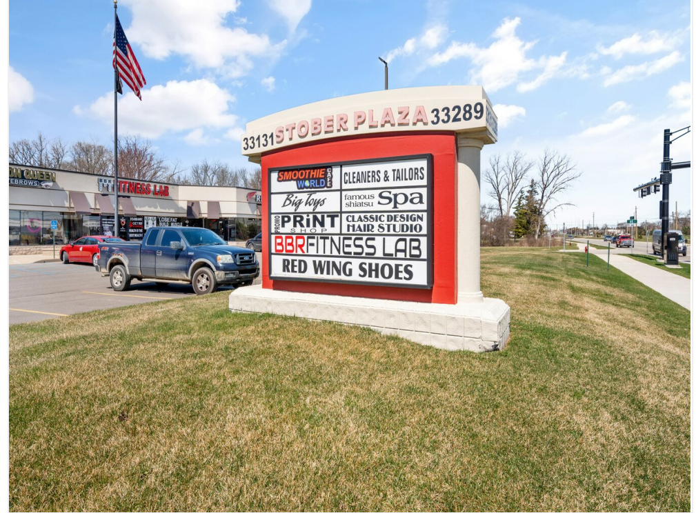
33241 Mound Rd_055