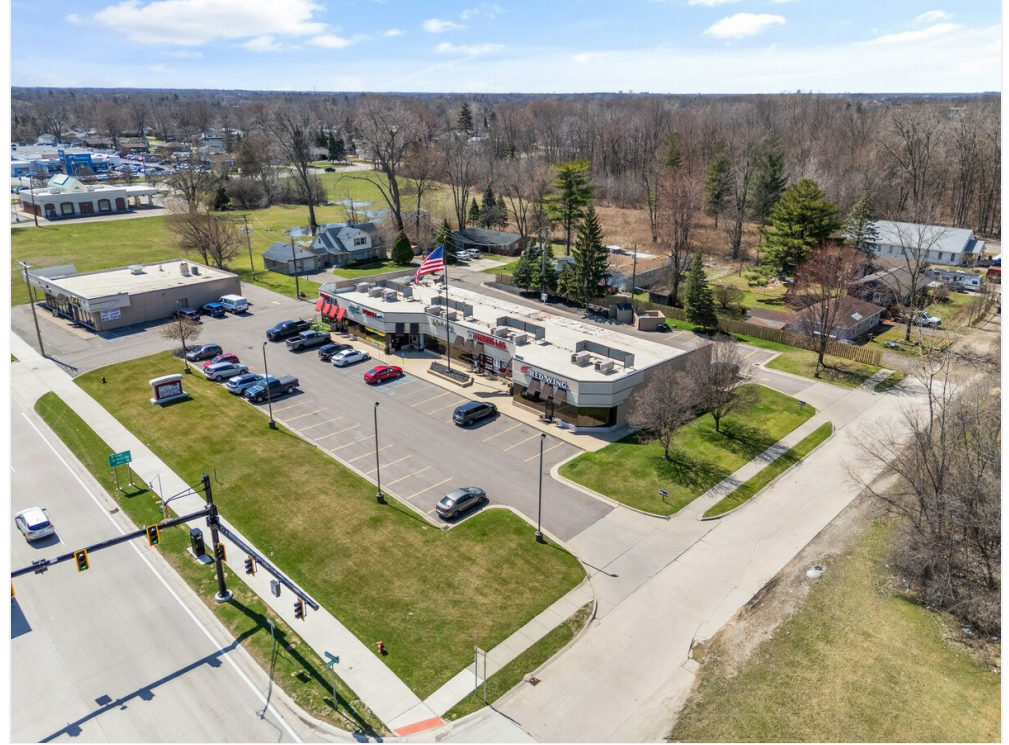
33241 Mound Rd_070