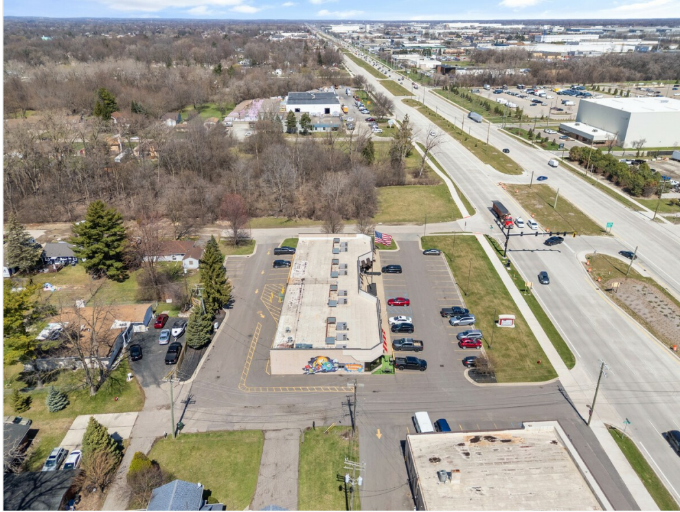
33241 Mound Rd_079