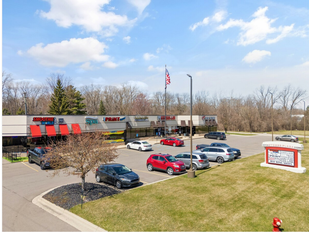
33241 Mound Rd_085