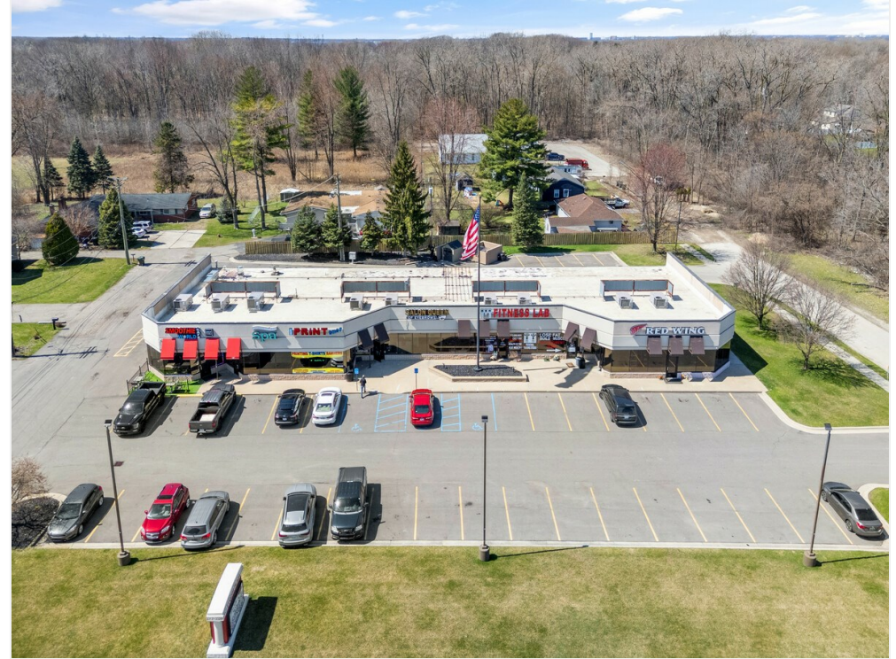
33241 Mound Rd_067