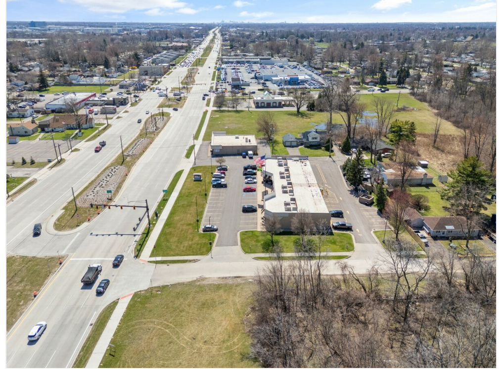
33241 Mound Rd_076