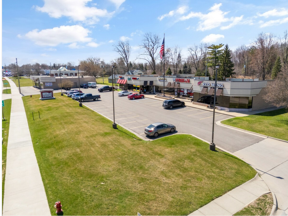
33241 Mound Rd_088