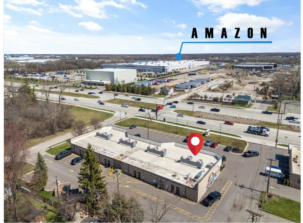
33241 Mound Rd_064-pint