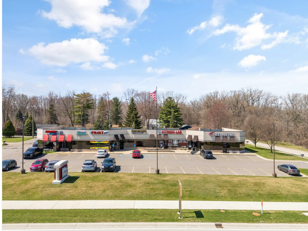
33241 Mound Rd_082