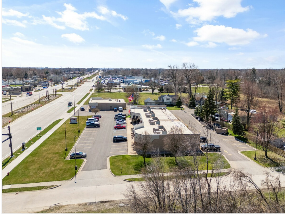
33241 Mound Rd_073