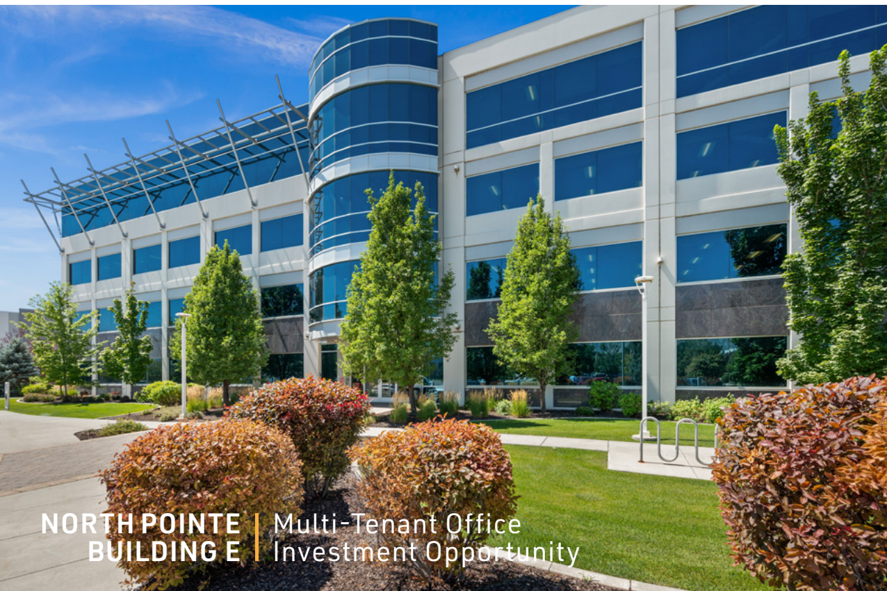
NORTH POINTE BUILDING E | Multi-Tenant Office Investment Opportunity

North Pointe E is well-positioned as a stabilized office investment within the Utah County market. The Property stands out due to its full occupancy, longer-duration lease profile, strong tenant roster, and dependable cash flow characteristics. Located in the high-demand northern Utah County submarket and benefiting from the continued expansion of Silicon Slopes, along with close proximity to a robust retail amenity base, the Property is supported by strong demographics, a deep and growing employment base, and continued economic expansion, making it a compelling opportunity for investors seeking secure income and long-term hold appeal.