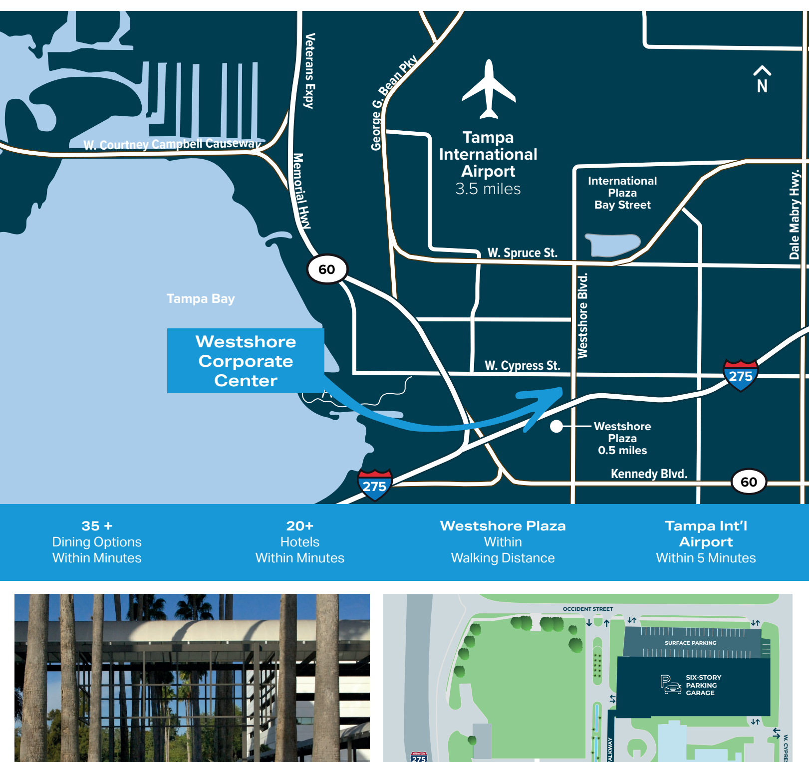
600 N. Westshore Blvd, Tampa, FL 33609