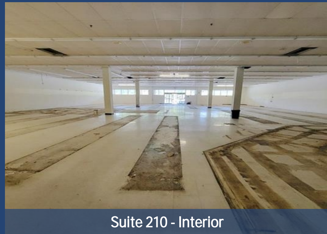
Suite 210 - Interior