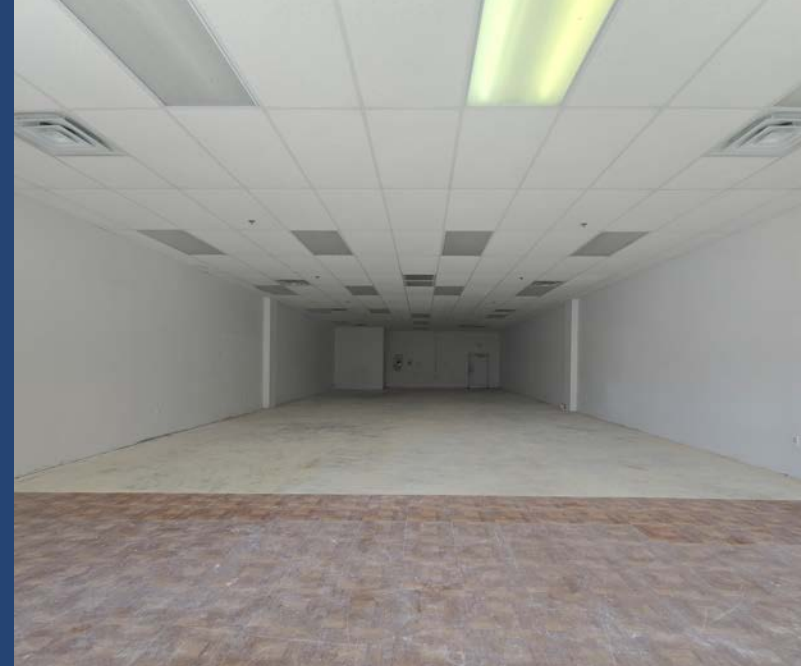
Suite 170 - Interior