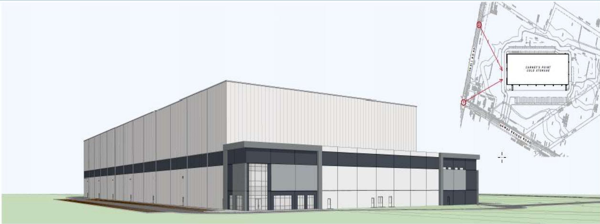
VIEW FROM SHELL ROAD