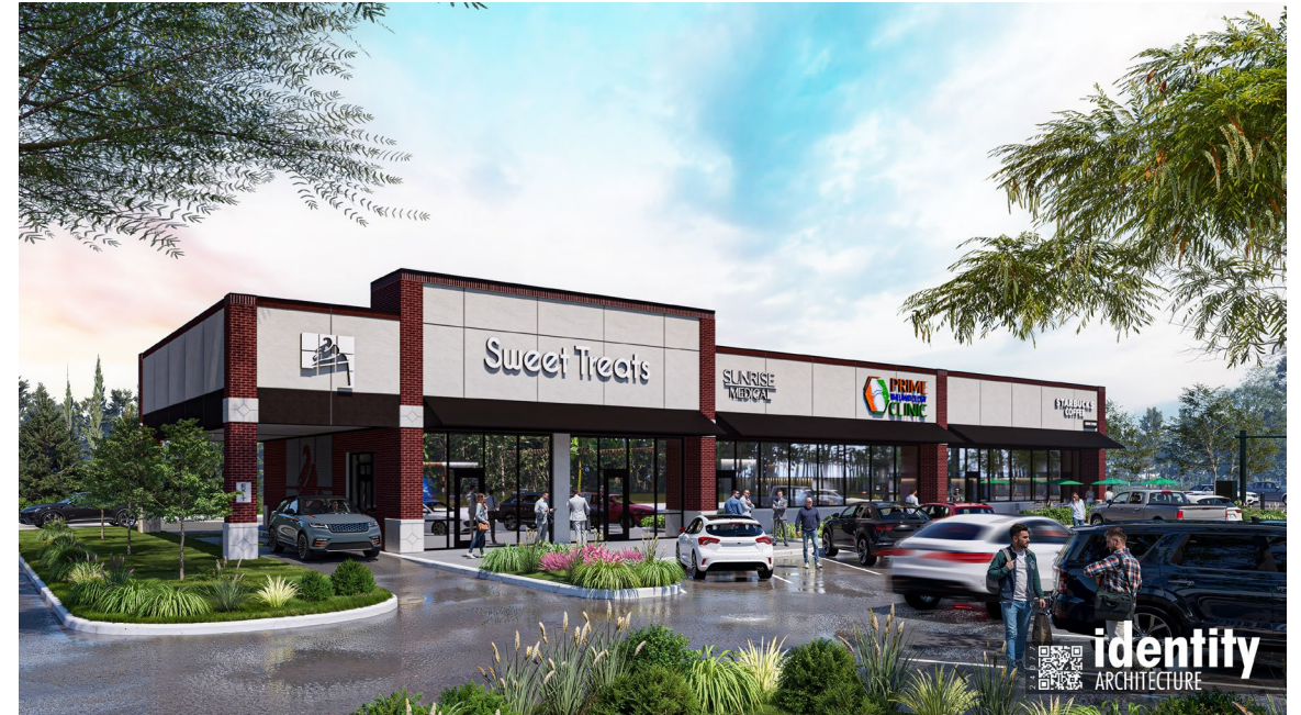
*Picture is rendering image of the future of the center.