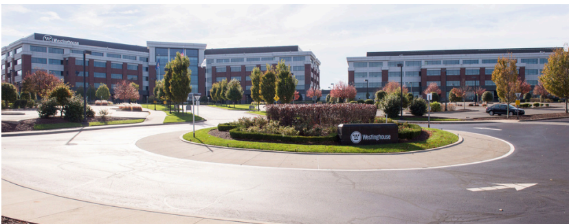
Front view of campus