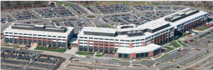
Rear view of campus