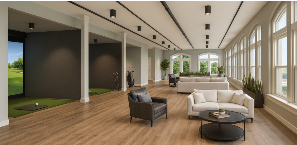
Golf Simulator Rendering