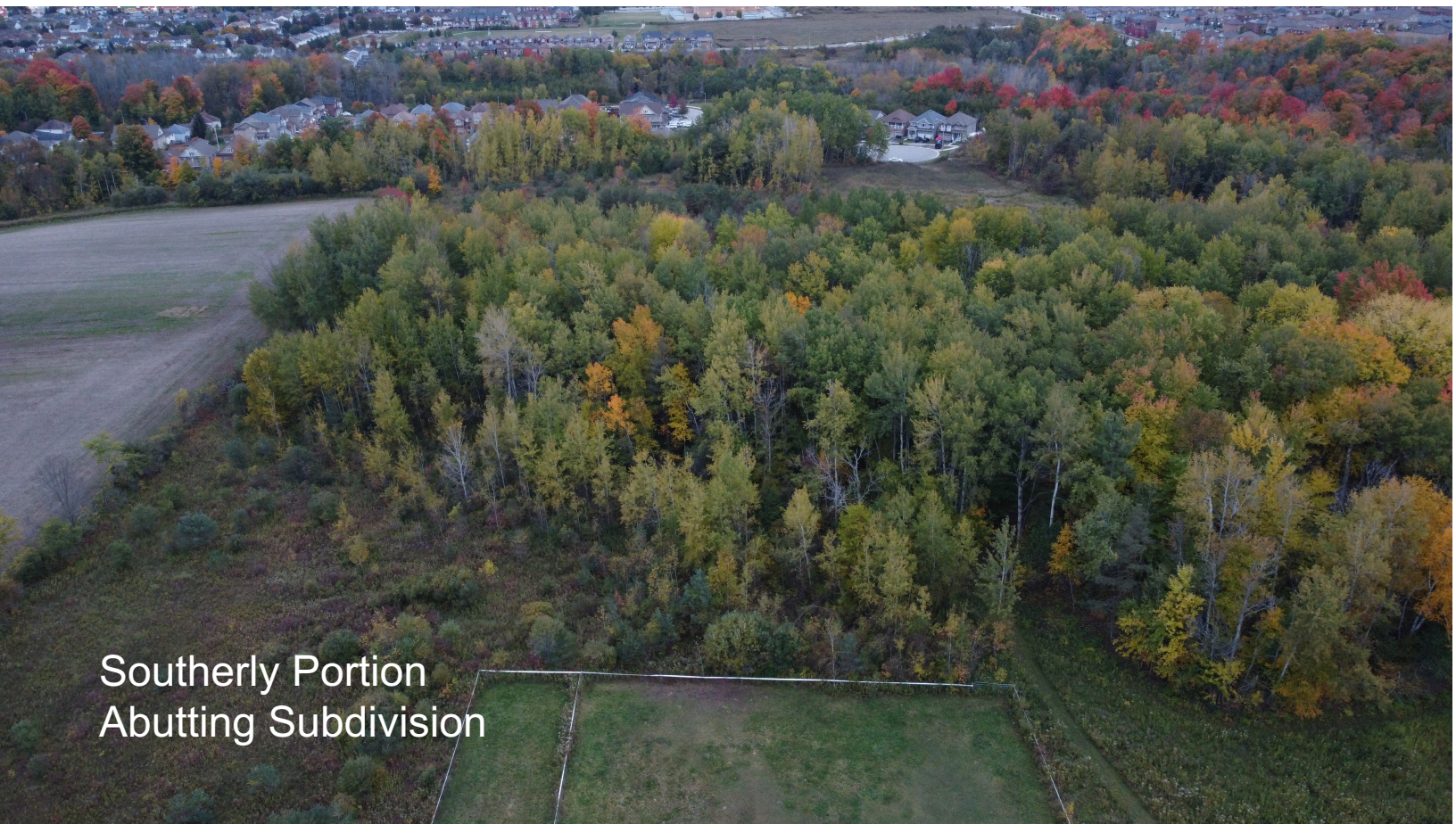
Southerly Portion Abutting Subdivision