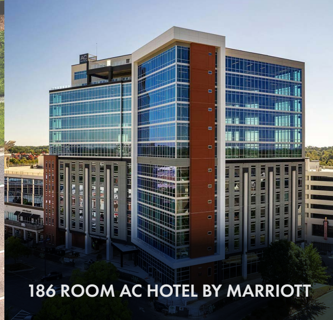
186 ROOM AC HOTEL BY MARRIOTT