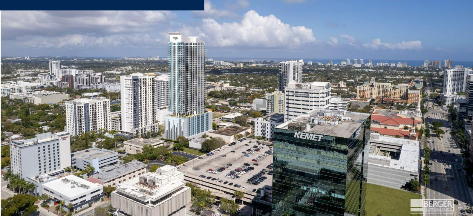
A 425 BRID-EYED VIEW 3