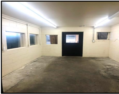
2 Bunker Offices Included