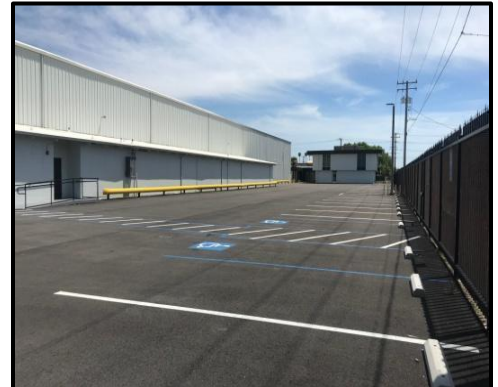
Secure Parking & Loading