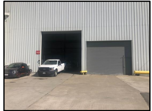
Direct Access Huge Roll-up Door