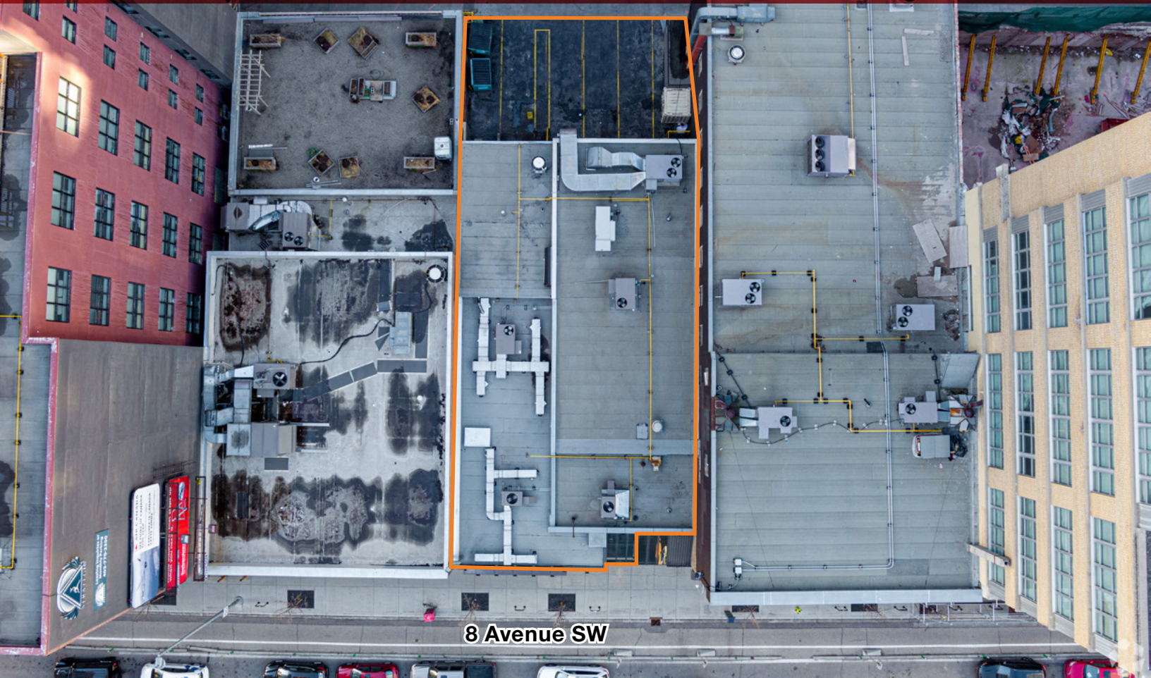
8 Avenue SW

FOR LEASE | TURN KEY RESTAURANT 4,330 SQ FT