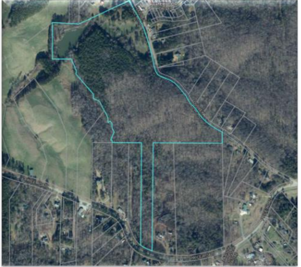
Aerial Facing South