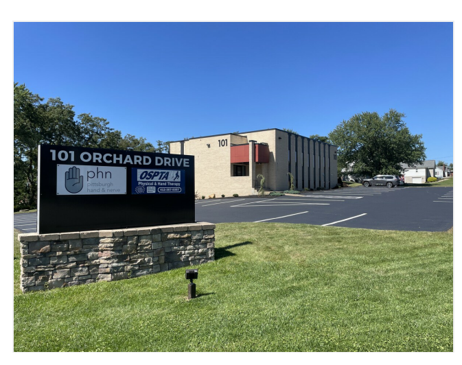
Signage on Rt 130

OSPTA Physical & Hand Therapy Pittsburgh Hand and Nerve, P.C.