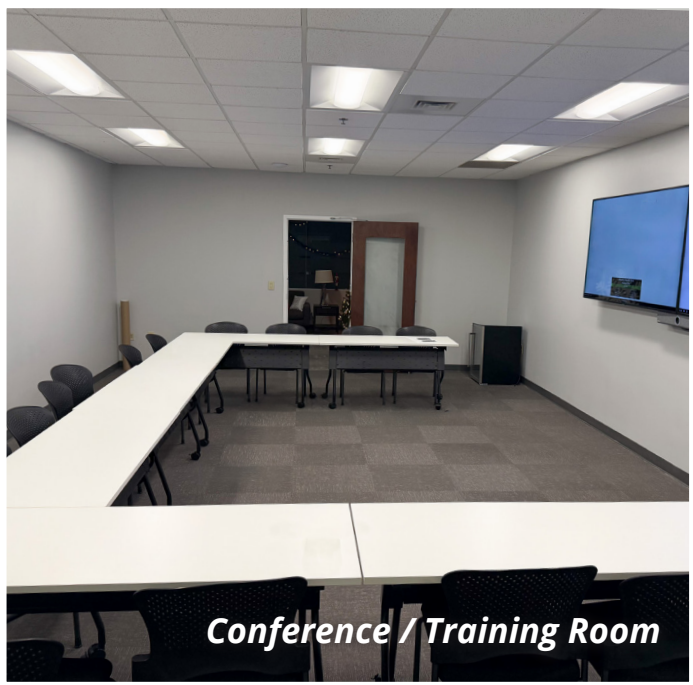
Conference / Training Room

10125 Berkeley Place Drive is a ±15,779 SF office building situated on ±4.089 acres in Charlotte, NC. Built in 2004 and zoned CC, the property offers a well-maintained, professional office environment with ample land and flexibility for a variety of office users. Its location provides convenient access to major interstates and surrounding business hubs, making it an ideal opportunity for owner-users or investors seeking a stable office presence in a strong Charlotte submarket.