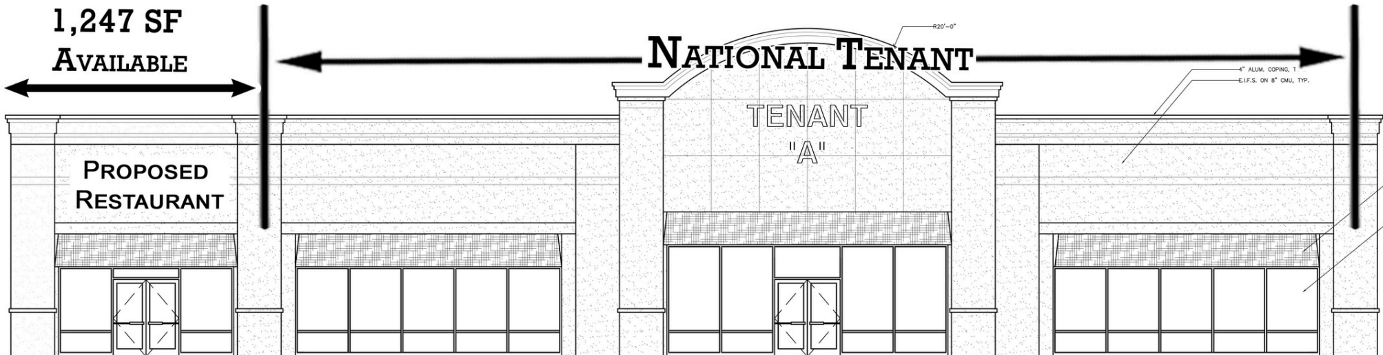
New Construction Concept